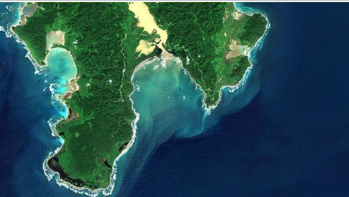
Satellite imagery captures the southern tip of Great Nicobar Island, specifically Galathea Bay in India. | Photo Credit: Photo by Gallo Images/Orbital Horizon/Copernicus Sentinel Data 2024

disclosure, given that it is "of strategic, defence and national importance and has confidential and privileged information", the NGT said, "The above disclosures reveal that the project is very important for India from the strategic point of view." In the order dated February 16, the NGT said, "A balanced approach is required to be adopted while considering the issue of allowing development of the port on a strategic location, the importance of which has already been stated in the previous paragraphs of this order and taking adequate steps to carry out the activity strictly in terms of the ICRZ Notification, 2019 instead of prohibiting the activity if the objection is based on apprehension." The NGT order said that to ensure "full and effective" compliance with the EC conditions, the Environment Ministry "will undertake all measures to protect the coral reefs along the coastal stretch and will also ensure coral regeneration through proved scientific method for regeneration of coral in appropriate identified areas abutting the project areas". The NGT asked the Environment Ministry to prepare and approve an "implementation plan" in this regard, suggesting that agencies like the Zoological Survey of India and the National